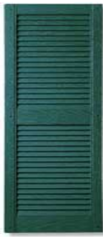
Classical Colonial Coastal French